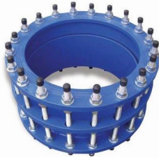
TABLE D, DUCTILE IRON, EPOXY COATED, STAINLESS STEEL BOLTS AND NUTS, PN16, COMBINED TIE RODS