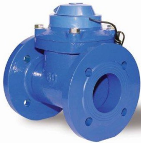
TABLE E FLANGE CAST IRON WATER METER, FBE COATED, C/W WITH REED SWITCH